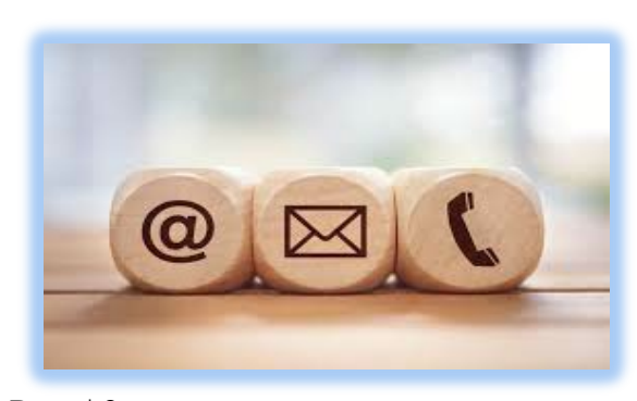
Page | 2

The district's plan to distribute this policy is to post it on district and school websites and in parent